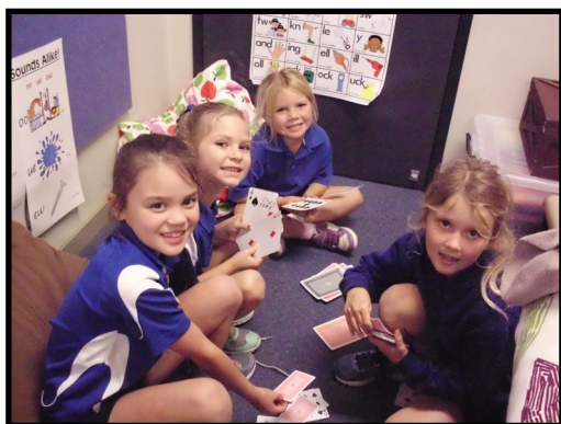
K-2 girls playing cards to enhance their knowledge of numbers.