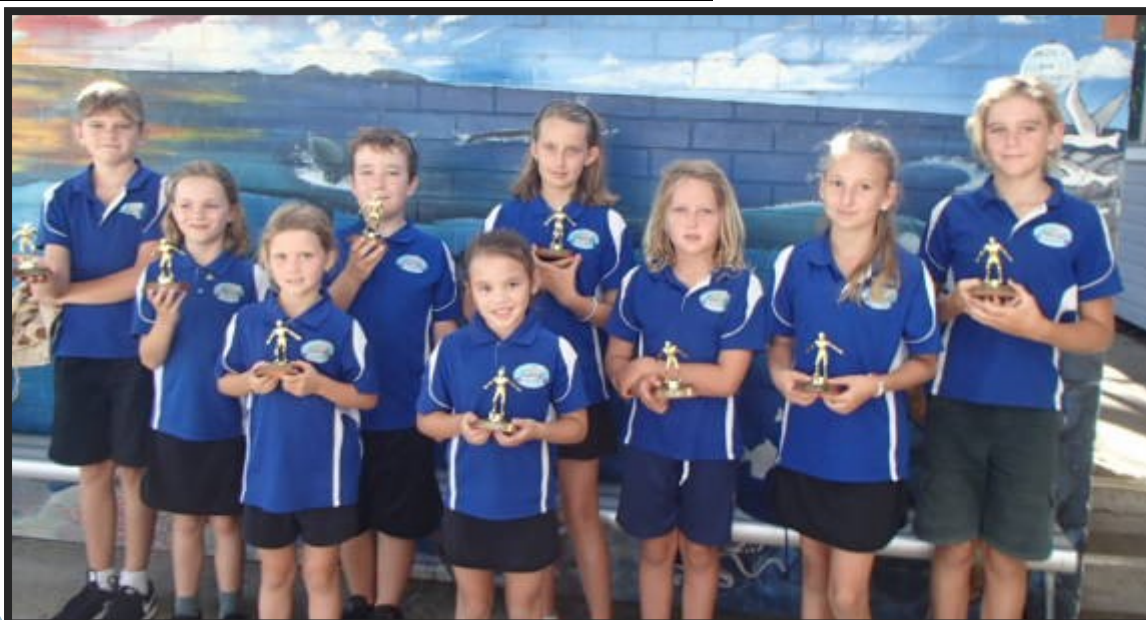
2017 Swimming Champions