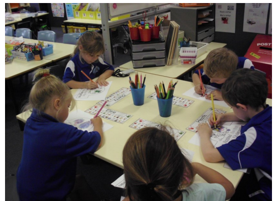
All Kindergarten Orientation hard at work.