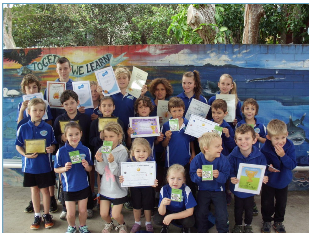
Congratulations to the Week 7 award recipients.