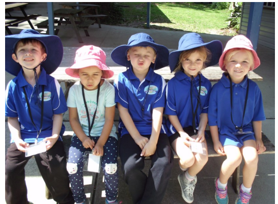
Kindergarten Orientation started this week.