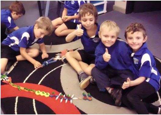
The boys are very proud of their Pattern Block Creation.