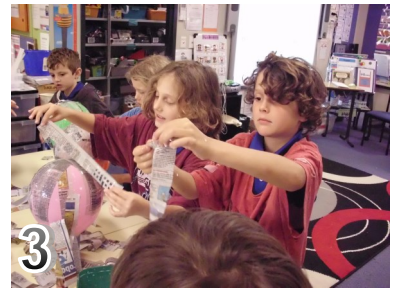
K-1's Paper Mache Hot Air Balloon Procedure