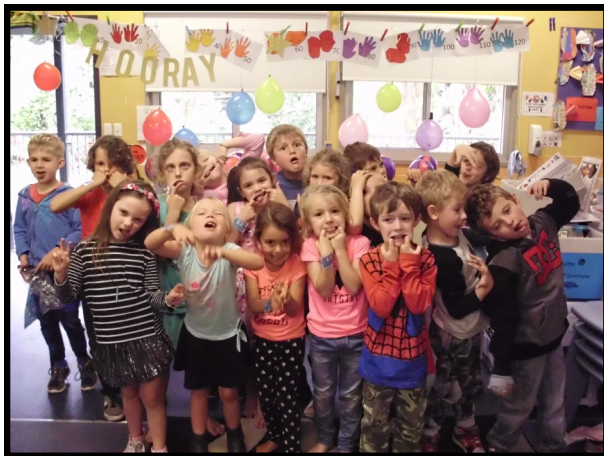
Dojo Fun Day Crazy Faces.