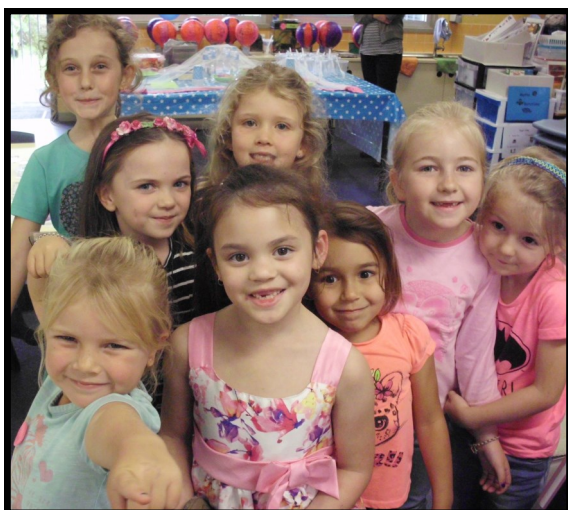
The girls enjoy Dojo Fun Day!