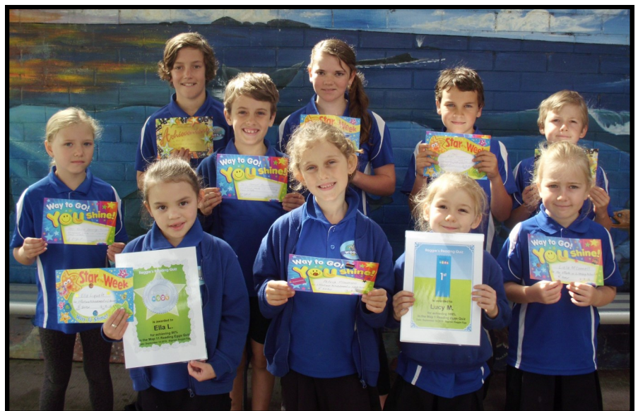
Congratulations to our award recipients for last week.