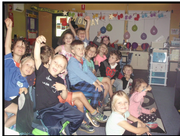
Movie time on Dojo Fun Day!