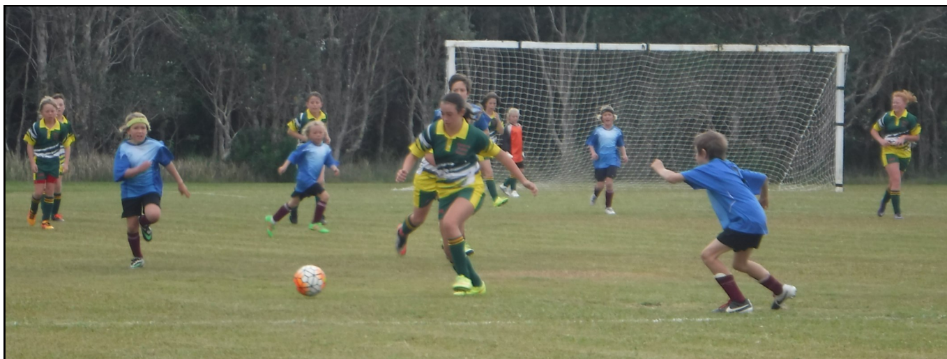
ACTION ON THE FIELD AT THE PSSA SOCCER KNOCKOUT AGAINST ULMARRA PS