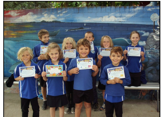
Week 5 Stars of the week