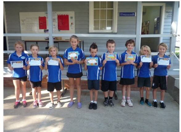
2-3 Award Recipients at last week's assembly.