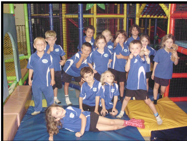
K-1 Excursion to the Jungle Gym.