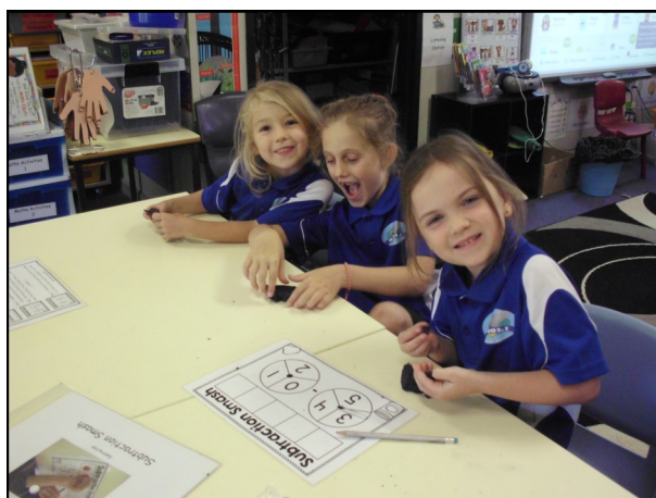
K-1's Numeracy learning has been based around Subtraction this week.