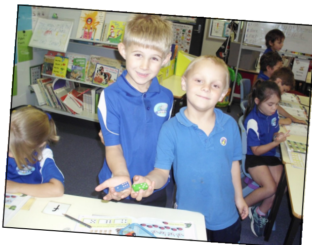
Year One have fun introducing the transitioning Kindergarten students to Maths Rotations.